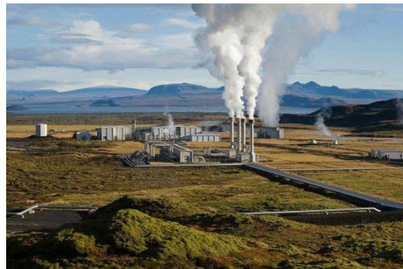
Geothermal power plant

Geothermal energy is renewable energy , which is a form of energy that doesn't get used up. Other types of renewal energy include solar, wave and wind power. They are alternatives to the fossil fuels industry, which has been our main source of energy for the past 150 years.