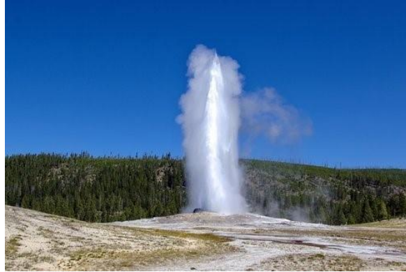
Old Faithful geyser, Yellowstone National Park

The word geothermal comes from the Greek words geo , meaning "earth," and thermal meaning "heat." Geothermal energy gets its power from the high temperatures and limitless heat energy found beneath the Earth's surface. The interior of the Earth is hot. Really hot. Temperatures inside our planet can reach 9,000° F! That heat can be safely harnessed and used to generate electricity. When geothermal energy turns the blades of a turbine (a machine that uses pressure from water, air, or steam to spin its blades), the rotation can run a generator which converts that power into electricity.