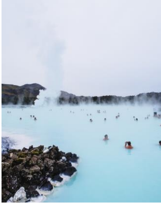
The Blue Lagoon, Iceland

Have you ever soaked in a steamy hot spring or watched a geyser erupt? A geyser is a hot spring under pressure that shoots boiling water or steam into the air. Old Faithful in Yellowstone National Park is probably the most famous geyser. These amazing natural features are examples of geothermal energy in action.